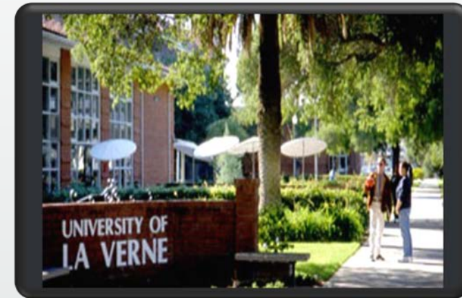
Institutional College and University Partnerships