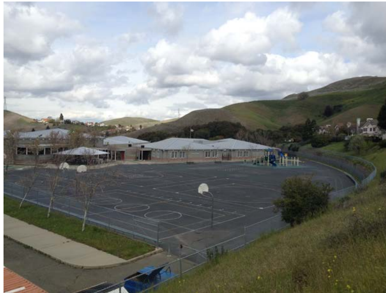
Hanna Ranch California Gold Ribbon Award